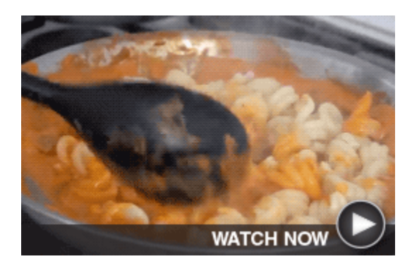
3 Ways to Enjoy Pasta Dinners Want to make a dinner that's fast? Healthy? Comforting? No matter what mood you're in, you'll find delicious ideas here.