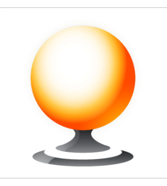
Try a World of Quizzes Join the world's largest quiz community and answer questions about sports, geography, music, TV, and other topics. Learn more...